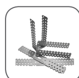
Clips & Brackets